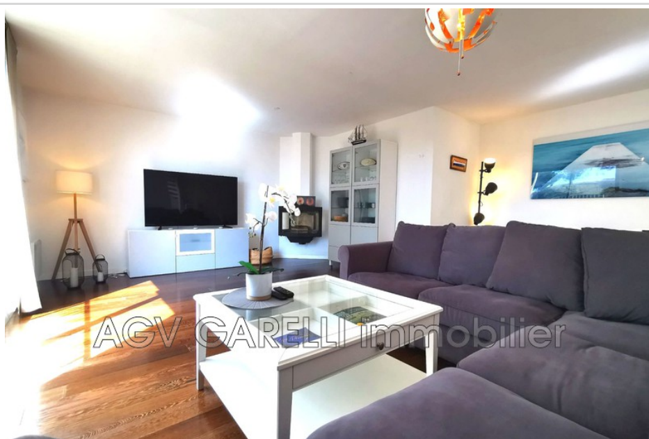
Apartment 1673 Toulon

Fees paid by the owner, in condominium(207 lots in the condominium), annual recurring charges 3 249 €(271 € monthly), no current procedure, information on the risks to which this property is exposed is available on georisques.gouv.fr